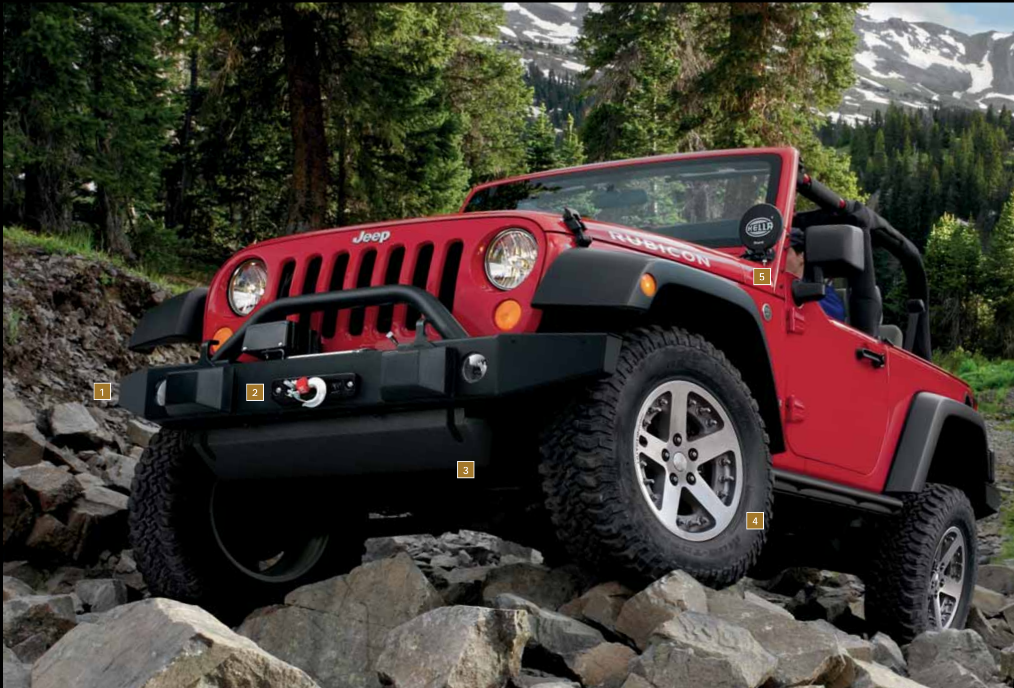
SHOWN ON COVER: FRONT OFF-ROAD BUMPER AND WARN® WINCH HELP YOU TAKE A WALK ON THE WILD SIDE.